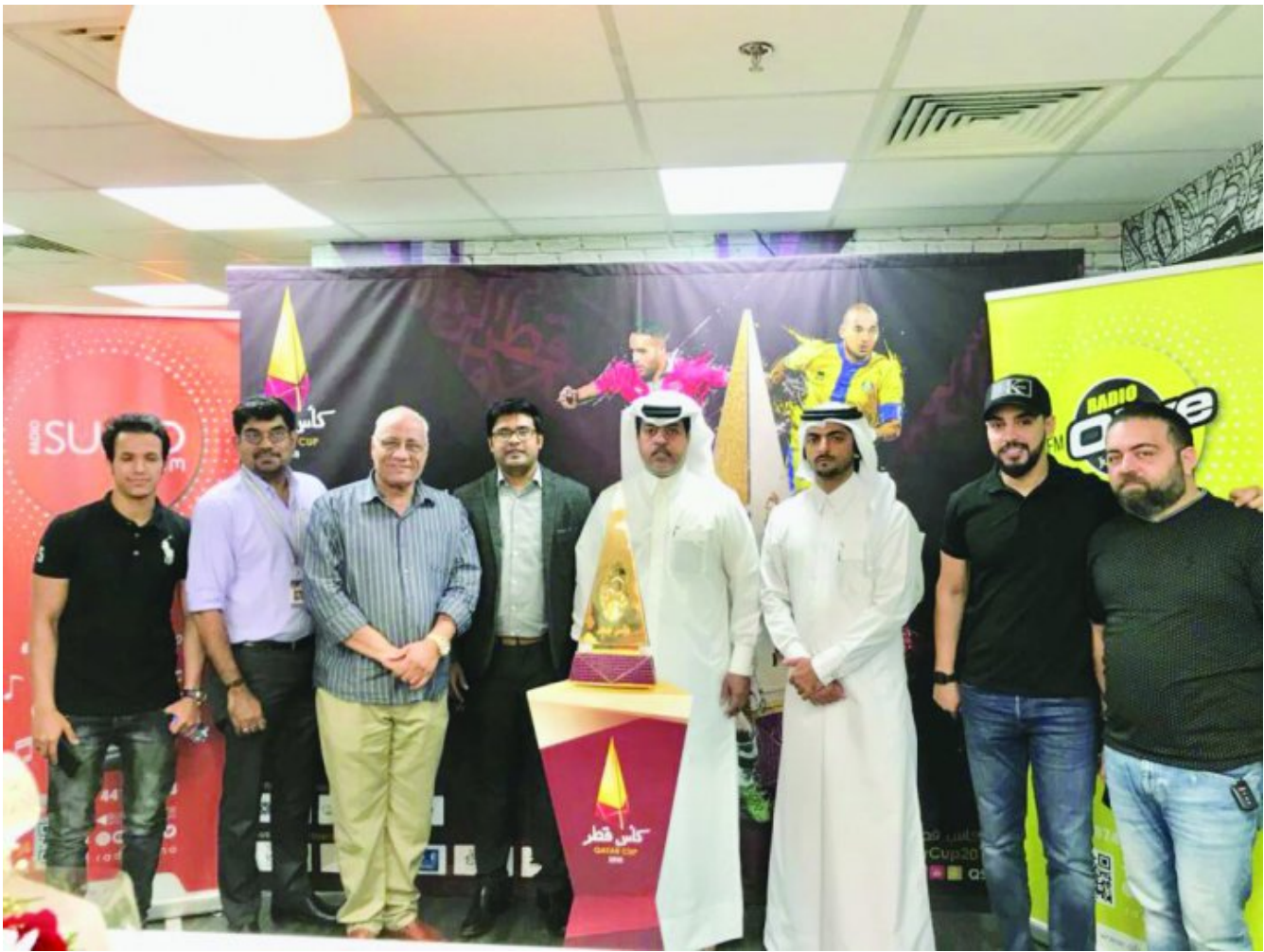
The Qatar Cup Trophy Tour team with Radio Olive and Suno officials.